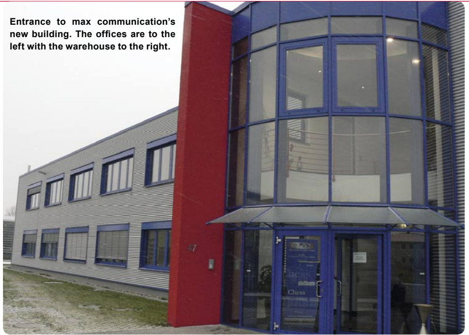
Entrance to max communication's new building. The offices are to the left with the warehouse to the right.