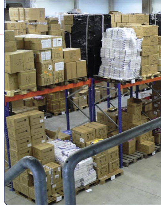
A look at the warehouse: pallets of satellite products