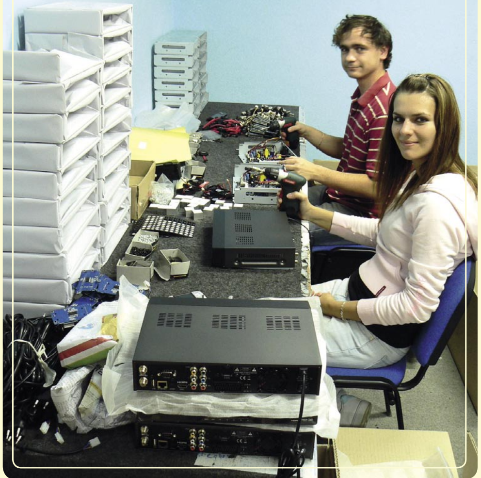
■ View of an area in the assembly shop: This is where externally sourced components are assembled by 16 employees until a finished AB-COM receiver can be individually tested for performance.

"Currently some 30 percent of sales are generated with SD receivers, with the majority of 70 percent being HDTV boxes." Looking at the AB-COM 200S success model Tomáš explains that "from a strictly economic point of view this is our best product: It offers top quality with all required features at a reasonable price." Juraj seconds that "this is exactly why we