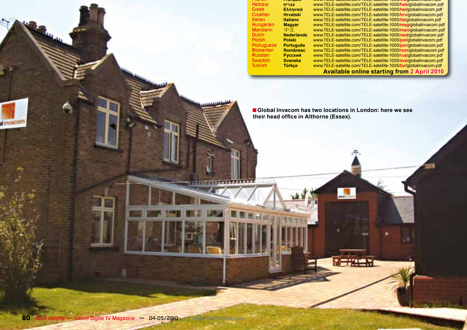
■ Global Invacom has two locations in London: here we see their head office in Althorne (Essex).

Available online starting from 2 April 2010