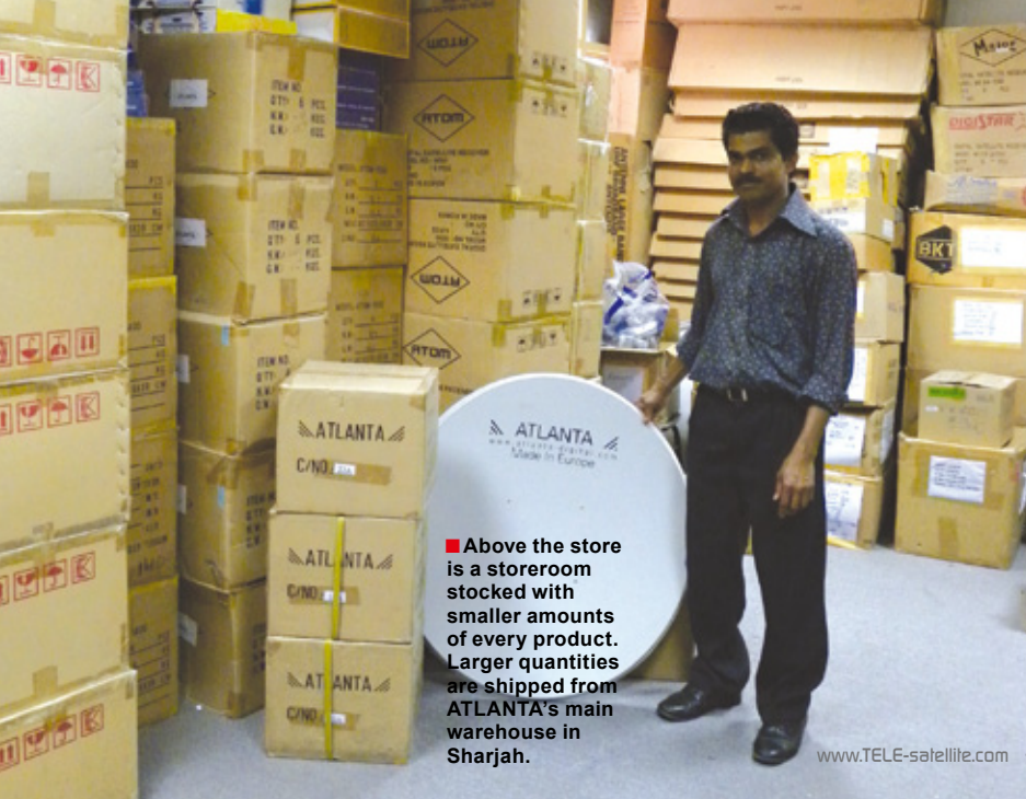
■ Above the store is a storeroom stocked with smaller amounts of every product. Larger quantities are shipped from ATLANTA's main warehouse in Sharjah.