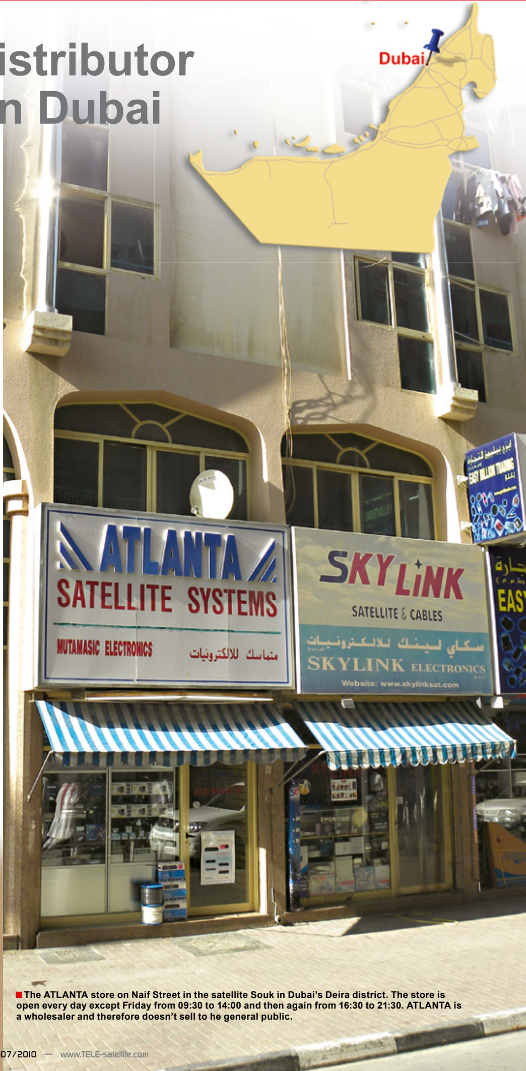
■ The ATLANTA store on Naif Street in the satellite Souk in Dubai's Deira district. The store is open every day except Friday from 09:30 to 14:00 and then again from 16:30 to 21:30. ATLANTA is a wholesaler and therefore doesn't sell to the general public.

But what to do with it? The cable manufacturer explained to him that this cable